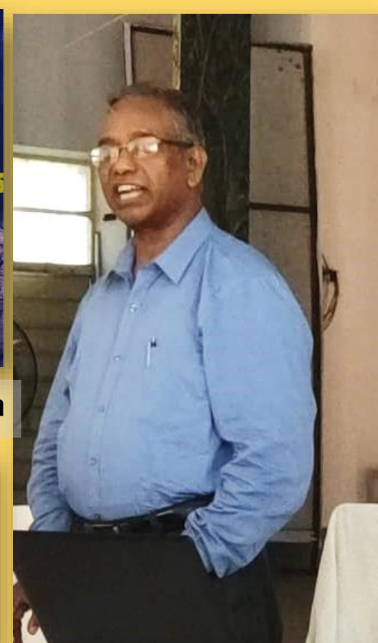
Mary's Meals Workshop @ Dumka Region

mary's meals A Simple Solution to World Hunger Training of School Feeding in Charges Dumka Region ORGANIZED BY: BREAD, NOIDA AT - SDC, DUMKA DATE - 2 nd OCTOBER 2019