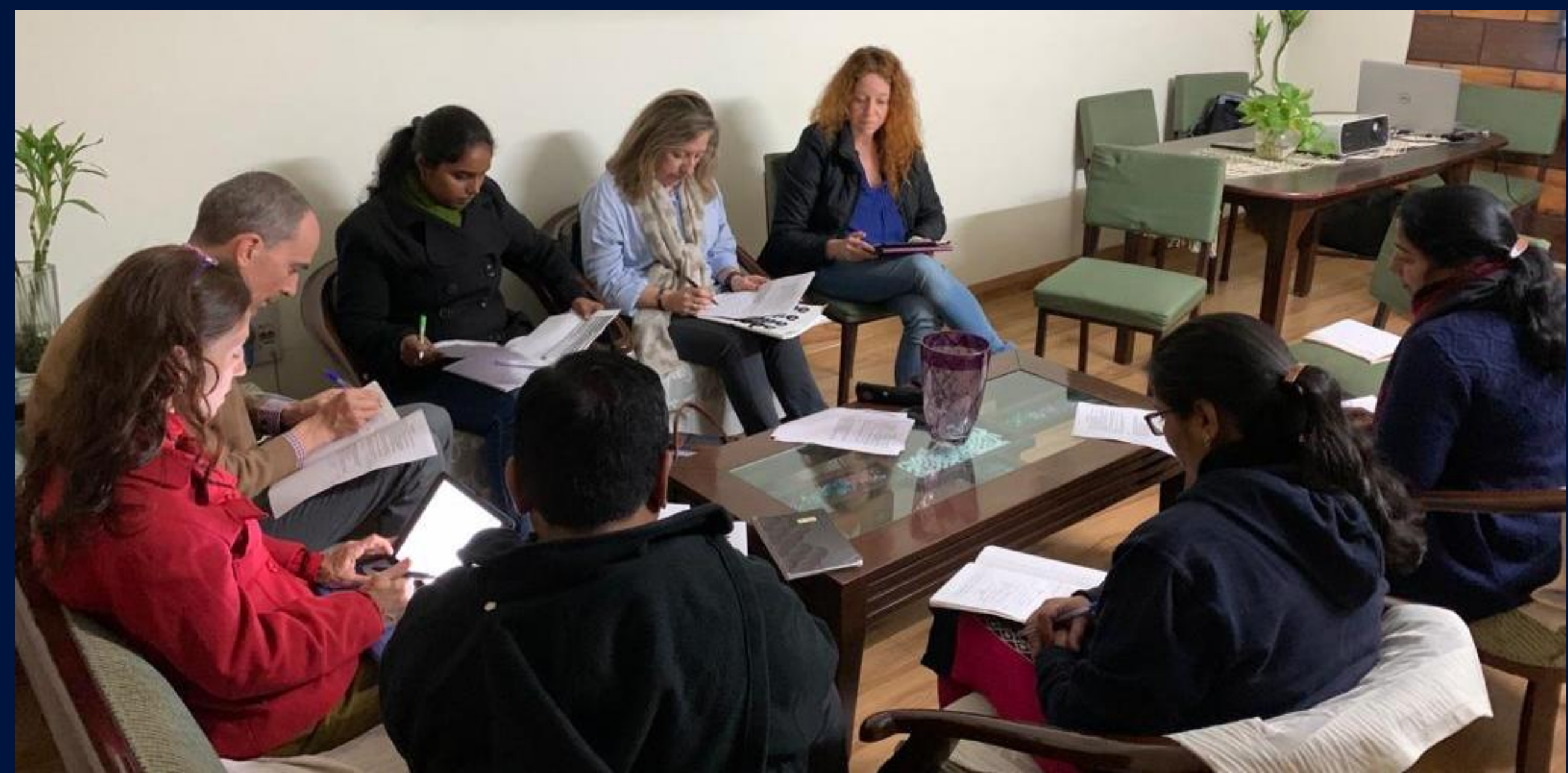
Business Meet with Deepak Project Officials