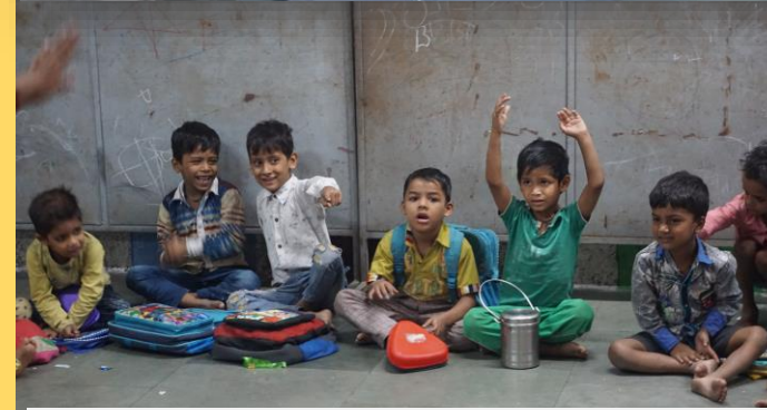
Mary's Meals @ Ursula Sangam Vihar, Delhi