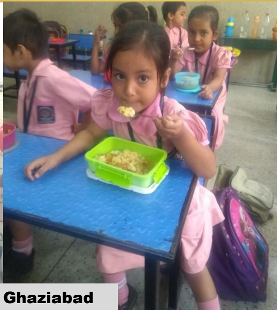
Mary's Meals @ Holy Child, Ghaziabad