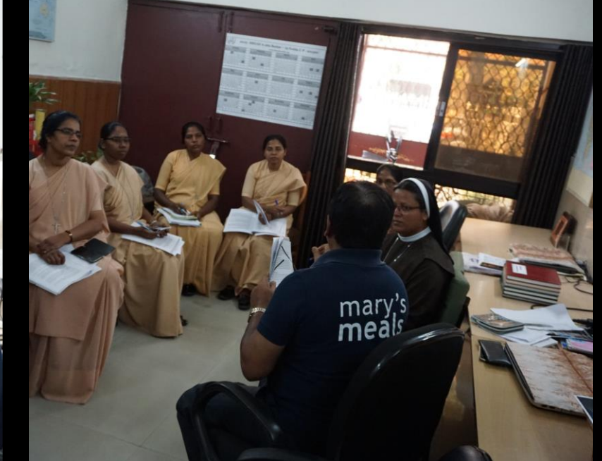
Two days Mary's Meals Training Program for the feeding in-charges, of Delhi NCR region @ BREAD national office @ Noida