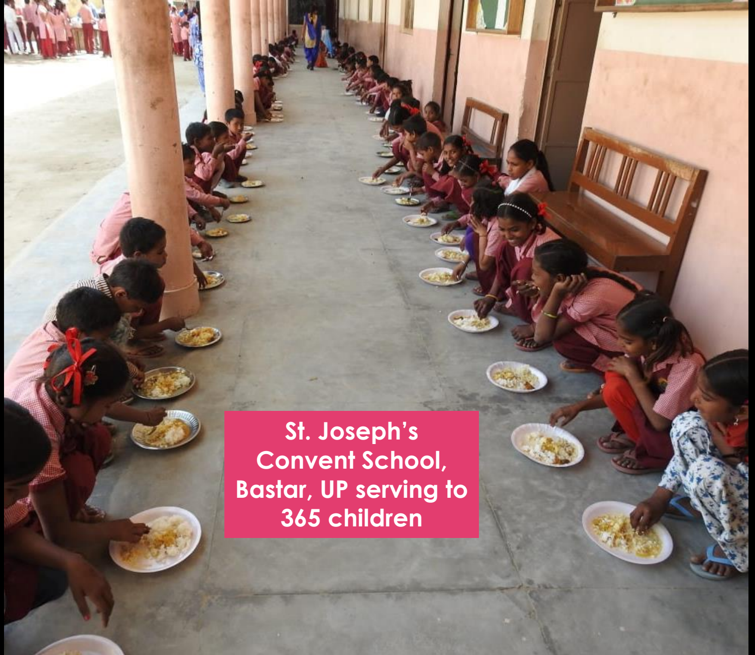
St. Joseph's Convent School, Bastar, UP serving to 365 children