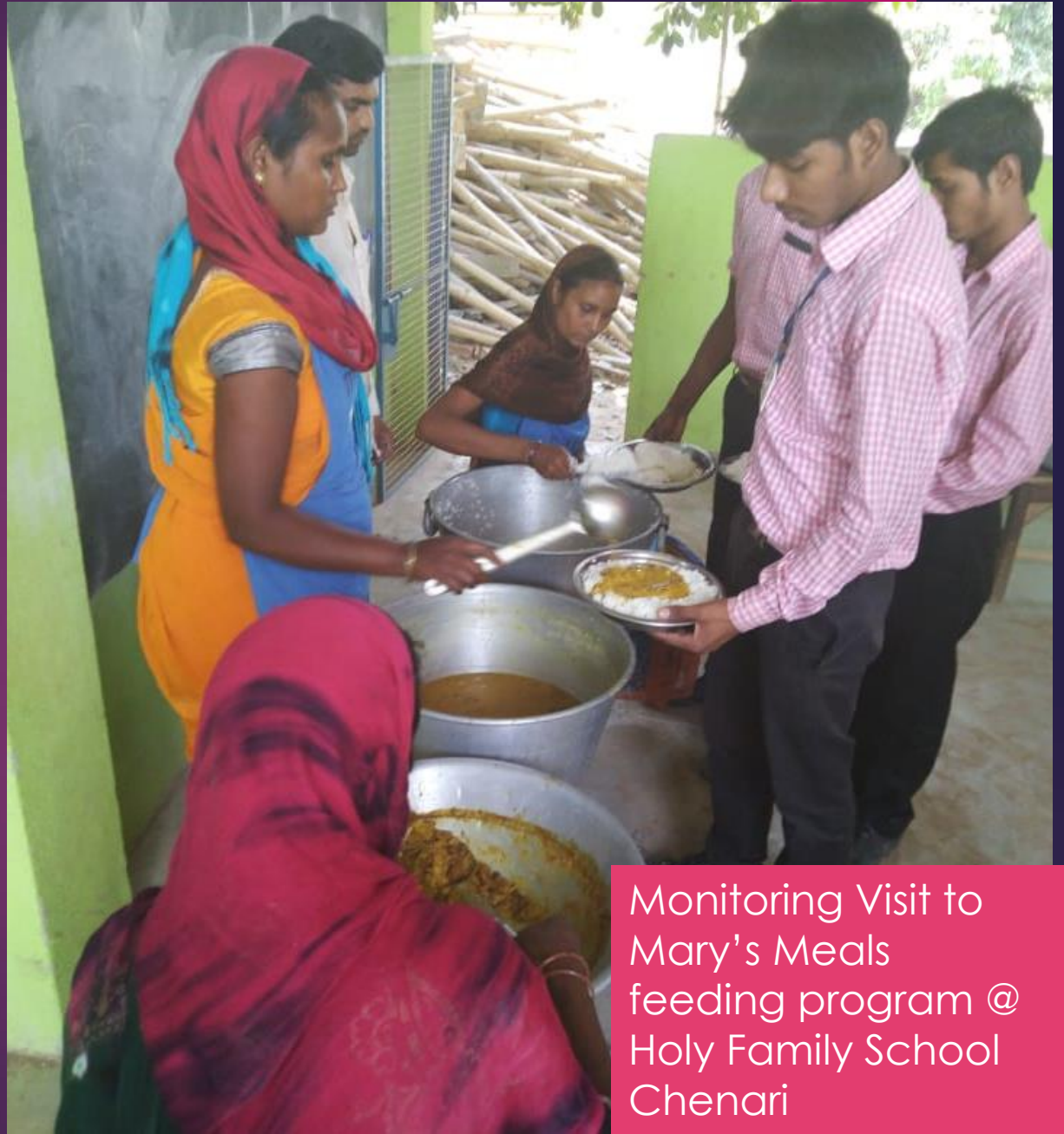
Monitoring Visit to Mary's Meals feeding program @ Holy Family School Chenari