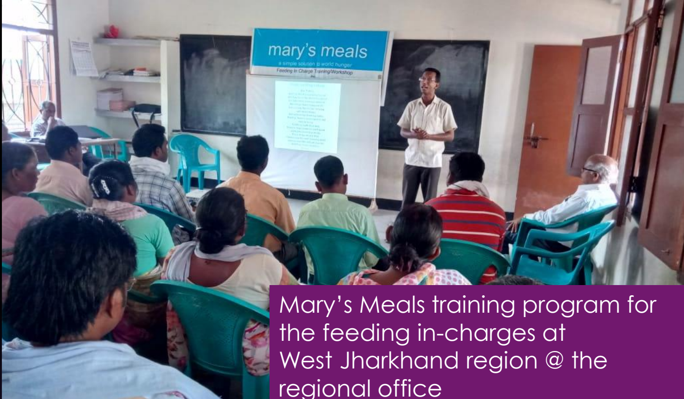
Mary's Meals training program for the feeding in-charges at West Jharkhand region @ the regional office