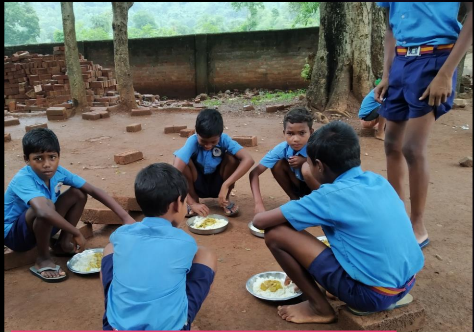
Jeevan Jyoti Middle School, Satia North Jharkhand reaching out to 510 children